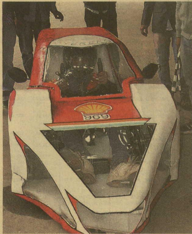
The Alterno can attain a maximum speed of 35 km an hour

Tirki said, "Alterno uses a 12-volt battery that produces 10 Ampere current. The proj-